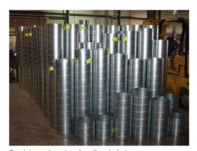
Precision cut custom length spiral pipe.

On projects like these, timing is everything. Gamewell Mechanical has cultivated a reputation for reliable service in demanding pharmaceutical projects—a reputation the company isn't willing to risk on a low bid supplier who can't help them rise to the challenge.